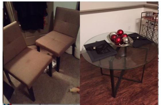
Table and two chairs

Dimi 214-476-5509 dwaters@mesquiteisd.org